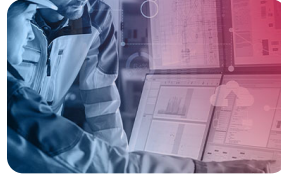
Schools & Workshops